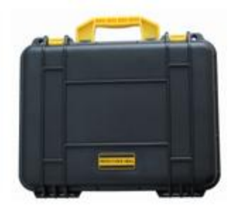
Portable instrument box