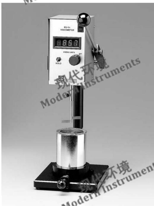
FIG. 5 Digital Stormer-Type Viscometer

15.2 Suitable Hydrocarbon Oils , calibrated in KU and traceable to NIST, available commercially.