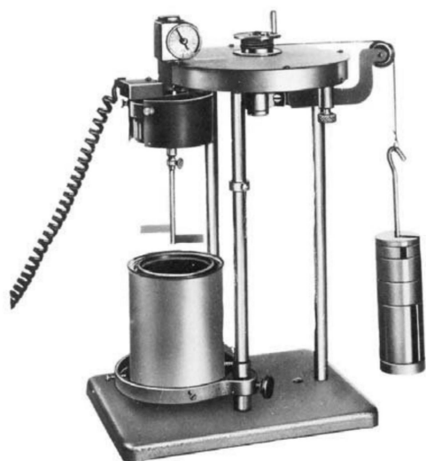
FIG. 1 Stormer Viscometer with Paddle-Type Rotor and Stroboscopic Timer

9.3 When the temperature of the specimen has reached equilibrium, stir it vigorously, being careful to avoid entrapping air, and place the container immediately on the platform